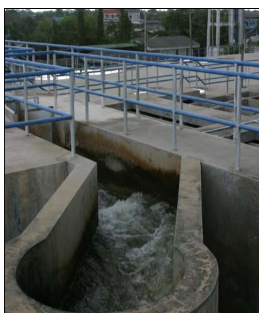
Figure 1 – How to insert a figure

The pictures are used to show key points of the research. You should use them but avoid resolution overkill, more than 150 dpi but less than 300 dpi.